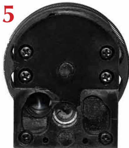
Image 5: After seating pellet, turn mag so pellet appears in center hole and left hole is ready to accept another pellet. Repeat steps 1-5 until mag is filled.

.177-cal. mags are 10mm deep .22-cal. mags are 10mm deep .25-cal. mags are 10mm deep 9mm mags are 11mm deep