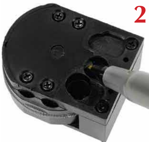
Image 2: Using the tip of a ballpoint pen, push the tab up to unlock the circular clip. The spring will rotate the clip to the next hole. Repeat until the tab no longer shows. The mag is now unwound.