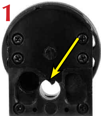
Image 1: When you load your magazine, the center hole may have a small black tab hanging down into the hole (arrow). If it does, go to step 2.

(As the rifle fires, the mag unwinds clockwise, bringing the next pellet in line with the bolt.)