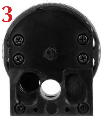
Image 3: This shows the magazine with the spring completely at rest. Notice that the tab does not show.