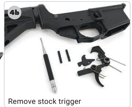
Remove stock trigger