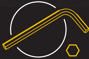
5/64" Hex key