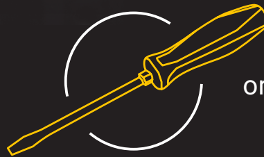
Flat head or hex key to remove pistol grip