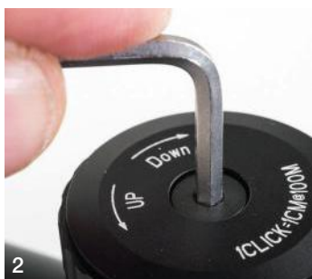
2 6-24 Turret adjustment