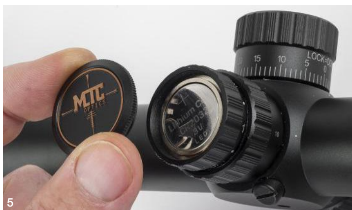
Figure 5: The illuminated reticle battery is housed in the parallax sidewheel turret

The rheostat is powered by a CR2032 battery, accessed by unscrewing the rheostat cover on the side turret ( figure 5 ).