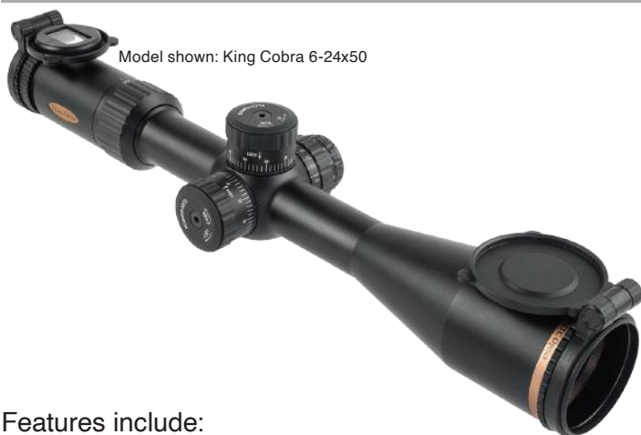
Model shown: King Cobra 6-24x50

Manufactured to MTC Optics' exacting brief, King Cobra scopes incorporate cutting edge technology in their design brief and have been built using state-of-the-art manufacturing processes.