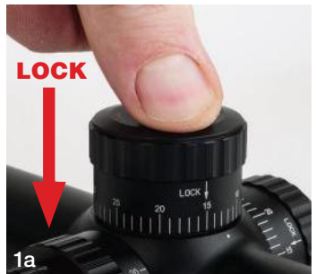
Figures 1/1a: Unlocking and locking the external adjustment turrets