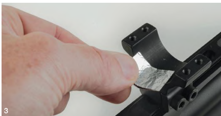
Figure 3: Put a strip of silver foil in the cradle of the rear mount to 'shim' the scope if the POI is initially a long way below the horizontal crosshair

Tip: Use a strip of silver foil, folded to greater thickness if necessary, as a shim. You could also use a strip of old 35mm camera negative. However, do not use adhesive tape as this can cause the scope to move within the mounts when the temperature changes. Never shim the scope more than 0.3mm.